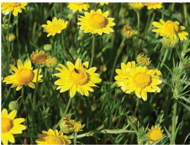
Fig. 4. Vernal pool endemic composite Lasthenia conjugens . Introductions of this species have levels of genetic variation similar to those of wild populations (Ramp et al. 2006).

The success of translocations is, of course, dependent on context and on events that occur during the translocation. In many translocations, these factors vary stochastically among sites